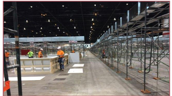
Construction crews work at McCormick Place to convert the convention center into a makeshift hospital.