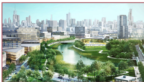
Artist's rendering of the Lincoln Yards project.

Sterling Bay is the developer of the dynamic Lincoln Yards project, which is a vibrant new development that will connect Chicagoans to over 50 acres of riverfront sitting between two of the city's most iconic neighborhoods: Lincoln Park and Bucktown.