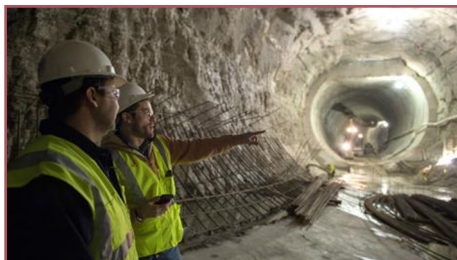
Trades workers involved in a Chicago Water Reclamation District sewer project.