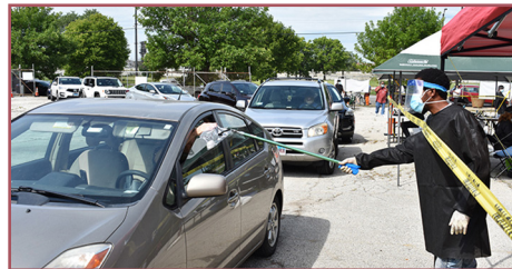
A staff member from CORE retrieves a swab sample from one of the many drive-in participants.

Exactly 369 residents of Chicago received FREE COVID-19 tests on Monday, August 17th from 10:00 a.m. – 4:00 p.m. Participants had the option of either walking up or driving up to go through the 5-minute test procedure.