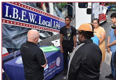
Electricians Local 134