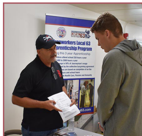
Ironworkers Local 63