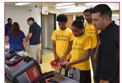
Pipefitters Local 597