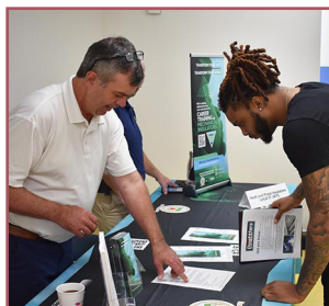
Heat & Frost Local 17