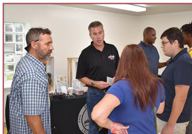
Sprinkler Fitters Local 281