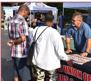
Roofers & Waterproofers Local 11