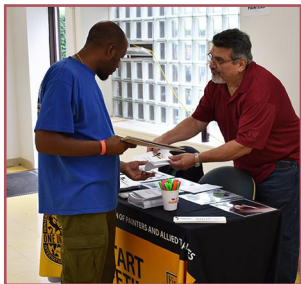
Painters & Drywall Finishers