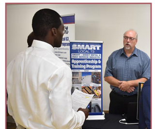
Sheet Metal - SMART Local 73