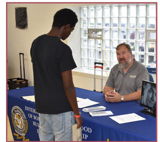
Boilermakers Local 1