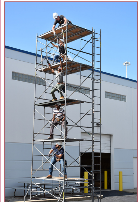
Apprentices at the Carpenters Training Center in Elk Grove Village perform a scaffold exercise. This top-notch training cannot be jeopardized.

The public comment deadline is August 26, so submit comments now!