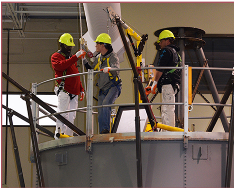
Apprentices at Painters District Council #30 undergo exercises on a simulated water tower at the training center in Aurora.

The current national system of registered apprenticeships has been launching Americans into the middle class since 1937. Construction apprentices who undergo the USDOL-approved programs become the most highly skilled craftsmen and women in the world. Today's building trades fund their respective apprenticeship programs through the collaborative efforts and expertise of both labor and management. This partnership has created the second-largest privately-funded educational system in the country – without using one single dime of taxpayer money.