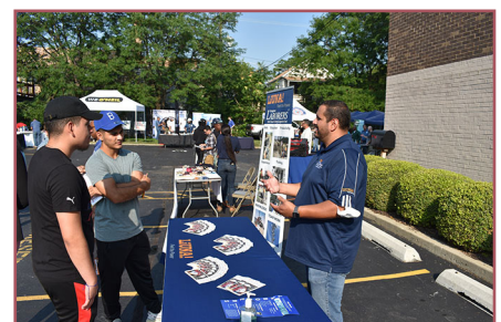
The Laborers' LiUNA representative talks to two young men about the variety of options within the trade.