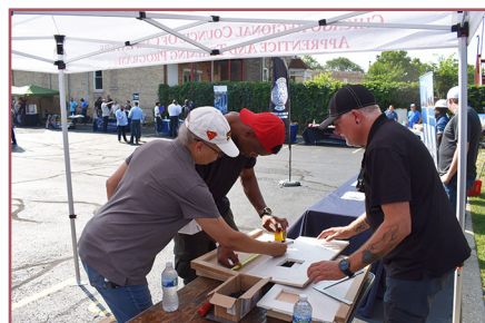
Carpenters work with a resident at measuring first, before cutting.