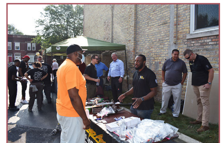
Painters District Council #14 was present with an information table.