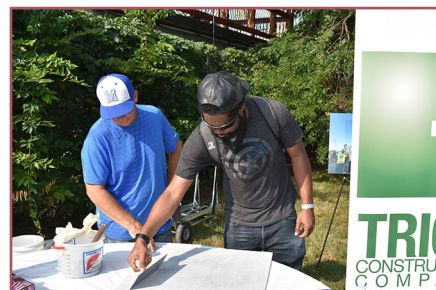
A participant tries his best at the Cement Masons Local 502 station.