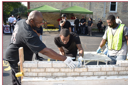
Bricklayer apprentices show a guest how to lay brick.