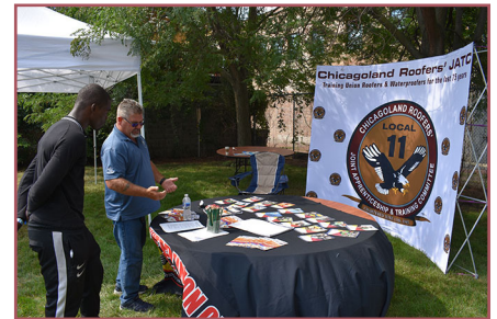
A visitor gets information from the Roofers & Waterproofer Local 11.