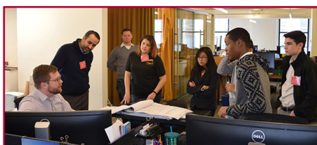
Students talk to a Clayco staff architect about his role in designing a current project.

That same morning the students attended a City Council meeting where aldermen were discussing an ordinance that was written after a fireman lost his life due to a contractor who allegedly violated safety code measures.