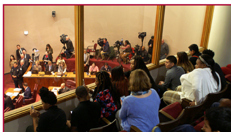
Students view a live City Council meeting as "bad contractor" ordinance is introduced.