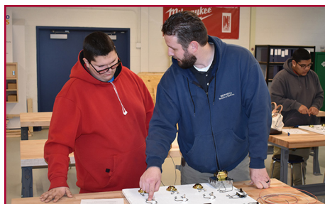
Electrical instructor provides project advice.