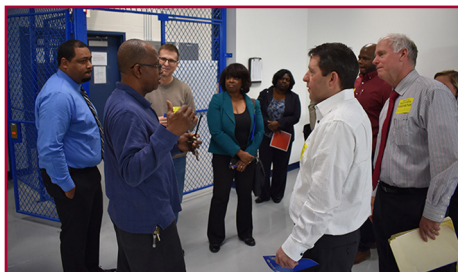
HVAC instructor talks to tour participants.