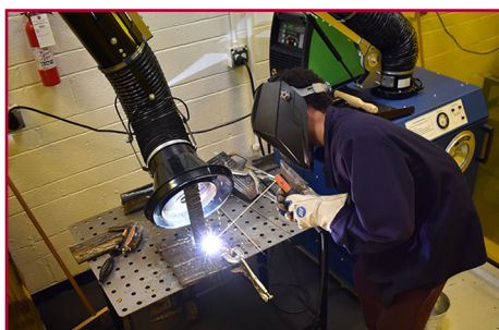
A student works on his welding assignment.