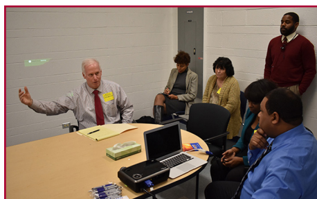
Pre-tour program update.

Additional pictures from the Dunbar tour are below as program instructors showcased their classroom activities.