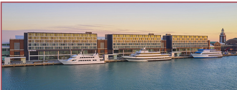
New Construction Chicago winner - Navy Pier Hotel & Rooftop Venue.

There is a new venue and a reduced ticket price, and along with our Keynote Speaker Chicago Mayor Lori Lightfoot, the event will include the recognition of CISCO's Annual Scholarship Awards recipients, and the winners of the Pride in Construction Awards (6 projects and three individuals).