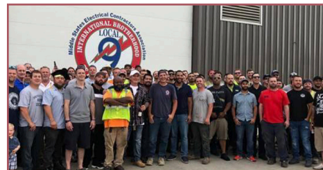
Proud members stand in front of the entrance of the new facility in University Park, and interior shot of main training area is pictured below.

The Center serves and instructs men and women who perform outside electrical work in the following fields: Cable Television and Telephone; Government; Utility; Line Clearance Tree Trimming; and Outside Construction and Distribution.