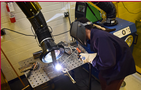
A student takes part in the Chicago Builds Welding Program at Dunbar HS.

With one school year under its belt, the Chicago Builds Program - a comprehensive citywide construction initiative designed to bring back the trade school model to Chicago public schools - was on display June 14th at the Dunbar High School campus as CISCO and city officials viewed the facilities and heard student success stories.