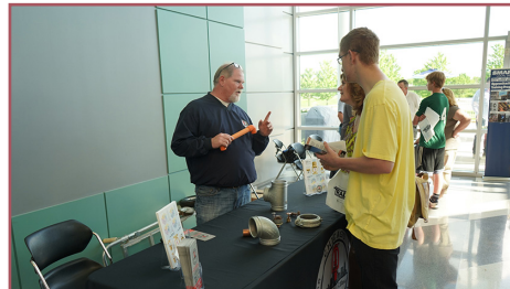
Sprinkler Fitters Local 281.