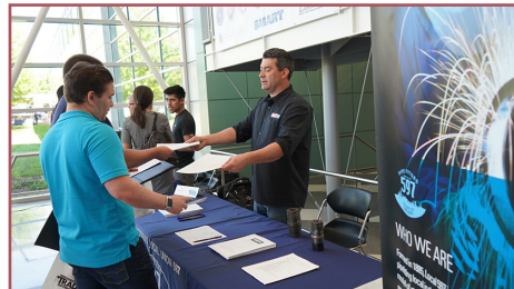
Pipefitters Local 597.