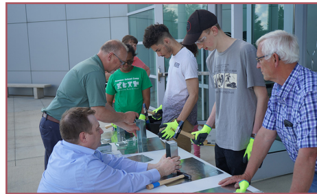
SMART (Sheetmetal Workers) Local 265.