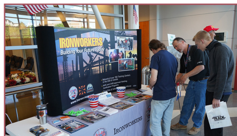
Ironworkers Local 393.