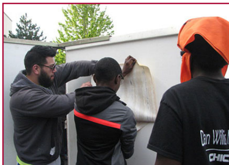
A student works on a wallpaper exercise under the watchful eye of one of the Painters & Drywall Finishers' apprentices.