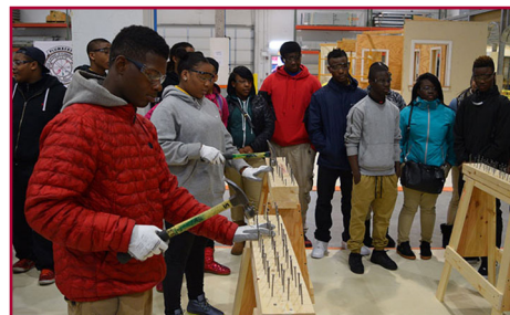
Students get ready to begin a hammering contest at the Carpenters station to develop proper technique.