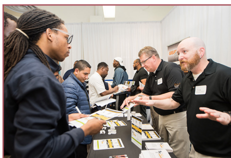
Finishing Contractors Assoc. of Chicago.