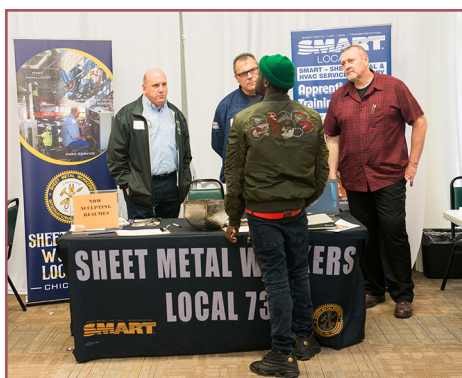
Sheet Metal Workers Local 73.