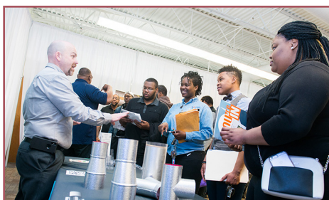
Heat & Frost Insulators Local 17.