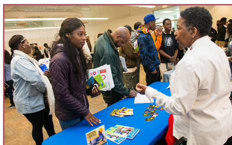
Chicago Women in Trades.