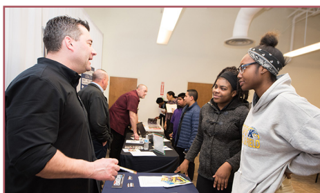
Pipefitters Local 597.