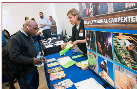
Chicago Regional Council of Carpenters.