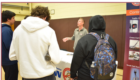
IBEW Local 9