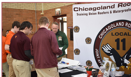
Roofers & Waterproofers Local 11