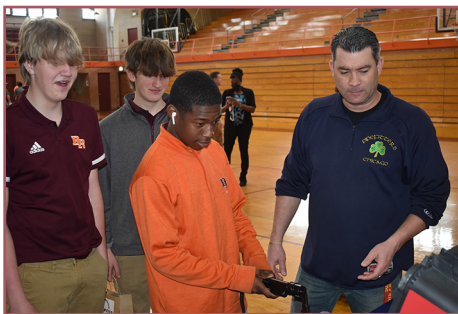
Pipefitters Local 597

Students got a chance to meet several different apprenticeship coordinators and instructors who were on hand to educate them about a career in the union construction industry. Instructors had interactive demonstrations and provided information on the application process, wages and benefits.