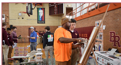
Tuckpointers & Bricklayers