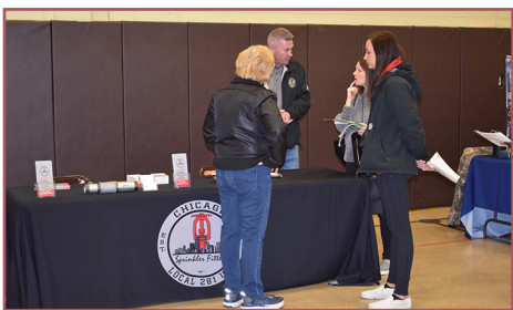
Sprinkler Fitters Local 281