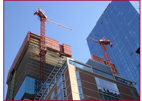
Crane (and its reflection) at 221 E. Erie St.

The Wanda Vista project on East Wacker is another example where cranes are in use. Following is a pictorial display of more projects that highlight the craftsmanship of the thousands of men and women who dedicate their lives to the union construction industry. (continues on back)