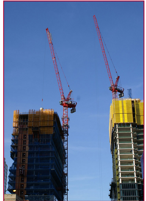
Twin cranes "Onward and Upward" at 640 N. Wells.