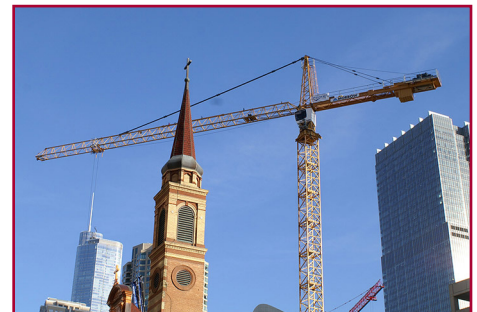
Crane in the heavens at 311 W. Illinois.