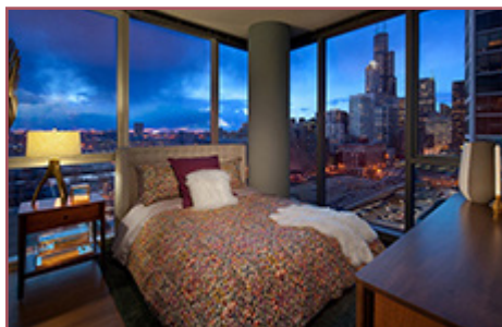
One of last year's winning entries was residential development at 1000 S. Clark Street in Chicago. Pictured is one of the rooms overlooking the skyline.

CISCO's Project of the Year Award is kicking off its 13th year of accepting applications for some of the best construction projects of the past 18 months. The award gives general contractors, owners, engineers and architects a chance to submit projects in 6 different categories that includes new construction, renovation, residential construction, and infrastructure. Visit www.cisco.org/projects-of-the-year/ to download the easy three-step application form.