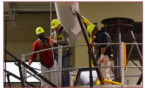
An instructor carefully watches as an apprentice practices using a rope to descend down the side of a tower during one of the planned training exercises.