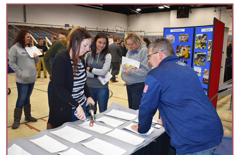
An advisor tries an exercise at the Roofers & Waterproofers Local 11 booth.