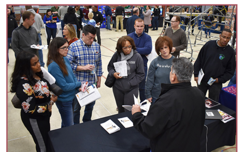
Counselors listen to application requirements for the Painters' program.