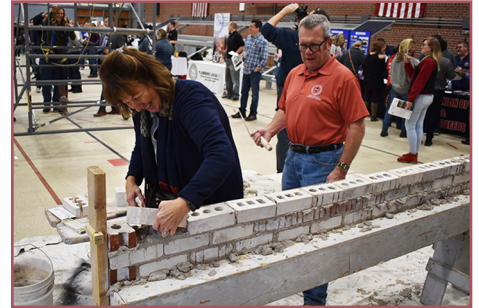
A counselor enjoys laying brick at the Bricklayers display.

At the conclusion, discussion of a follow-up conference involving parents ensued. More conference photos appear in the third column featuring members of the trades.