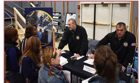
Counselors gather to learn about the Sheet Metal Workers Local 73.