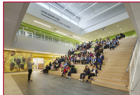
One of last year's winners is shown above – Luther Burbank Elementary School in Burbank, IL for New Construction - Suburbs Category.

CISCO's Project of the Year Award is kicking off its 15th year of accepting applications for some of the best construction projects of the past 18 months. (June 2018 - December 2019)