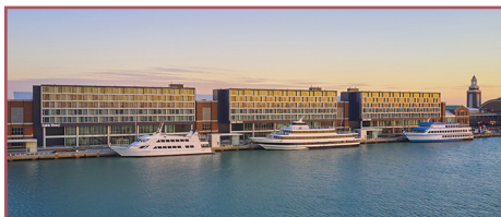
New Construction Chicago winner in 2020 - Navy Pier Hotel & Rooftop Venue.

CISCO'S Project of the Year Award is kicking off its 17th year of accepting applications for some of the best construction projects of the past 18 months (May 2020 – Dec. 2021).