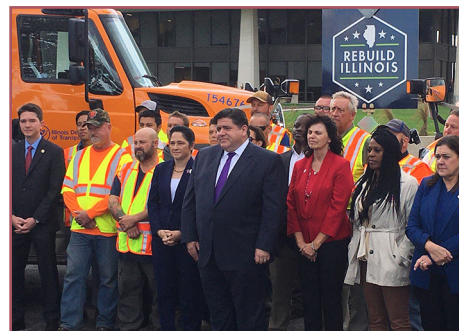
Gov. Pritzker poses with staff and construction workers during the MYP announcement.

Using rigorous and objective criteria, IDOT evaluated the condition, frequency of use, and crash and fatalities across the state's transportation system in planning the historic improvements.