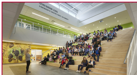
One of last year's winners is shown above - Luther Burbank Elementary School in Burbank, IL for New Construction Category.

The deadline for applications is 5:00 p.m. Wednesday, Dec. 4, 2019.