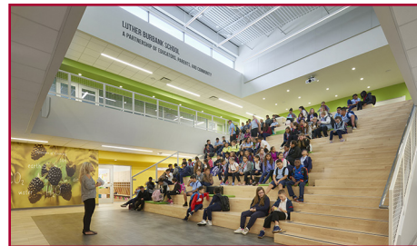
One of last year's winners is shown above - Luther Burbank Elementary School in Burbank, IL for New Construction Category.

CISCO'S Project of the Year Award is kicking off its 15th year of accepting applications for some of the best construction projects of the past 18 months. (June 2018 - December 2019)