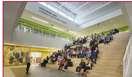
One of last year's winners is shown above - Luther Burbank Elementary School in Burbank, IL for New Construction Category.

CISCO'S Project of the Year Award is kicking off its 15th year of accepting applications for some of the best construction projects of the past 18 months. (June 2018 - December 2019)